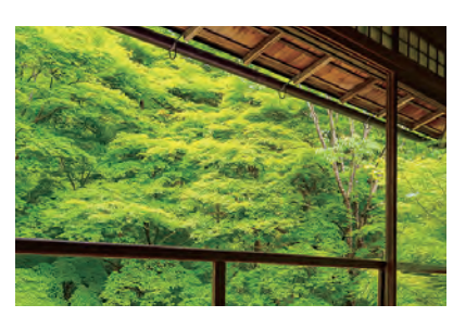
bizhub C227i model